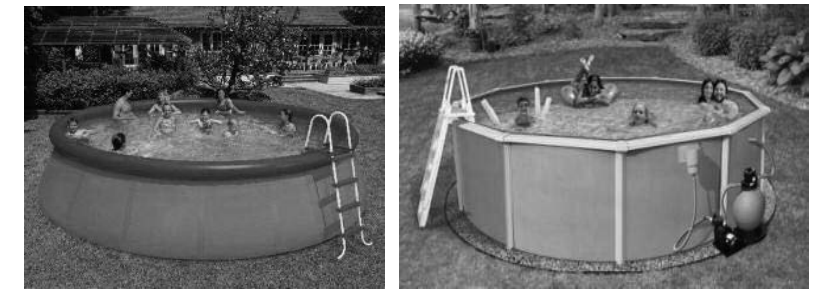
Examples of a Protected Above-Ground Swimming Pool which is in compliance with the code.

The deck in the last picture has a self-latching gate at the steps so that when a person exits, the gate shuts and latches. Now, if you don’t want to go to this great expense for a permanent type pool, simply purchase swimming pools that don’t hold more water than 24” and no safety barrier is required. Permit Required – If you wish to install a swimming pool that is taller than 24” in height, a Development Permit is required to ensure a proper safety barrier will be installed and that the location on the property conforms with the code. Start the application with Town Hall, Land Management.